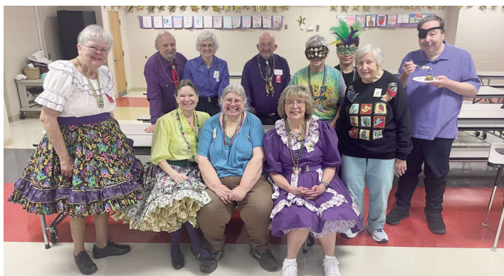
Bizzy Bees Marti Gras Dance

We'll finish out February with our Sweet Heart