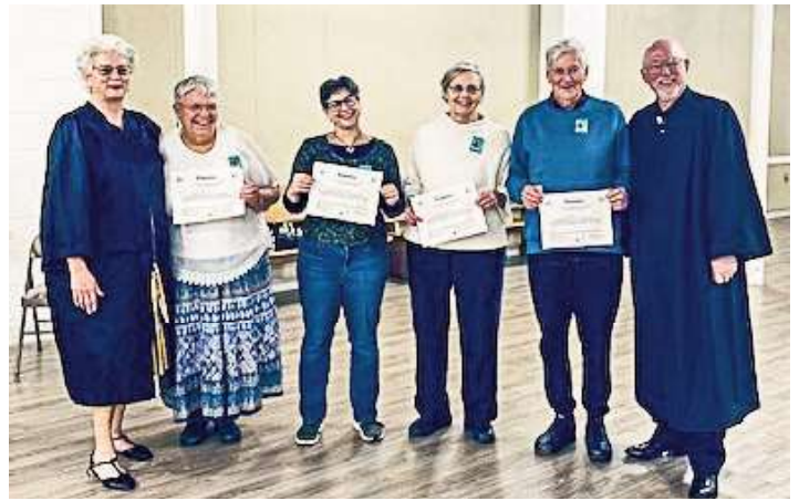
Gerrymanders Fall Semester Class Graduates

In January the Gerrymanders graduated four dancers from our fall class.